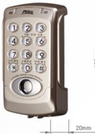
FRONT / SIDE VIEW