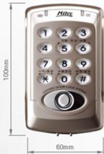
FRONT / FRONT VIEW