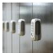
(Gym Personal Locker)