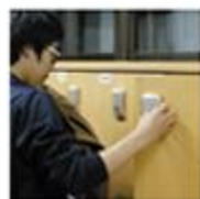
(School Individual Locker)