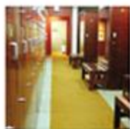
(Golf Course Locker)