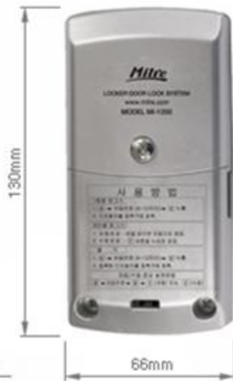
BACK / FRONT VIEW