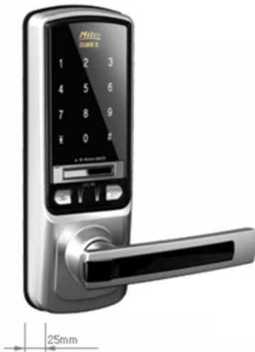
FRONT / SIDE VIEW