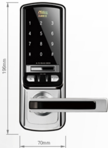
FRONT / FRONT VIEW