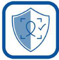
New Height of Anti-Spoofing