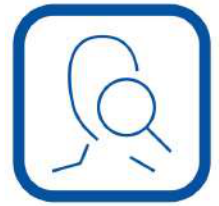
Touchless for Better Hygiene