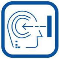
Proactive Facial Recognition